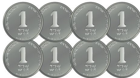
generates NIS 8.15

Each shekel invested in the mentoring process generates a return estimated at NIS 8.15 in addition to a return which is incalculable.