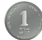
each shekel invested

We found that the average mentoring process lasted about 8.4 months.